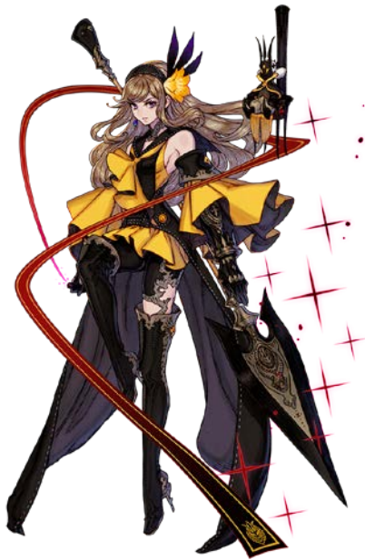
Guardian : Samantha RNA Evolution

When the number of pre-registered users exceeds 200,000, the "Terra Battle" ( http://www.terra-battle.com ) popular character "Samntha" will appear as a guardian in "Terra Battle 2" and be presented to all users. The above drawing, by "Terra Battle 2" main character designer Kimihiko Fujisaki, shows off the further evolved version of "Samantha".