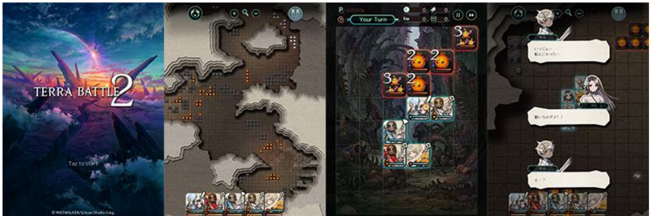
Screenshots from left to right: Title Screen, Field Map, Battle Scene, Event Scene